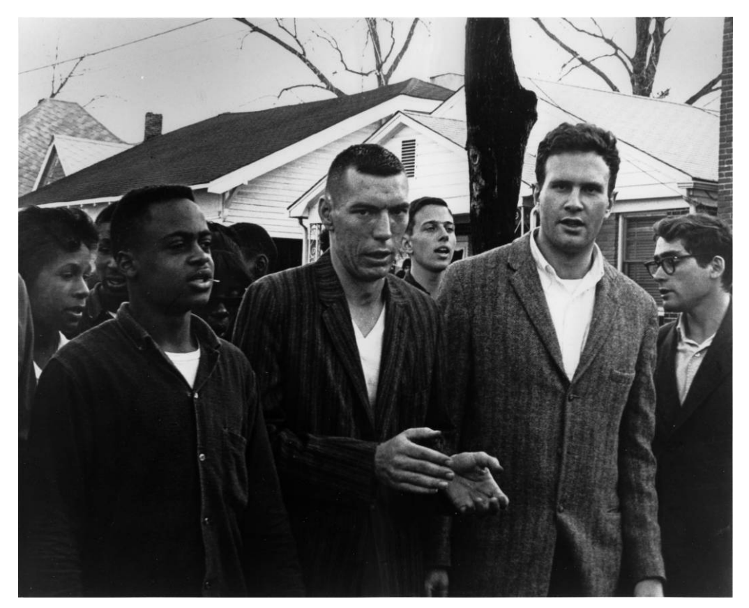
FIGURE 1: Civil rights marchers in Madison, Wisconsin.

was necessary for restoring domestic tranquility among a young discontented generation of citizens.<sup>22</sup>