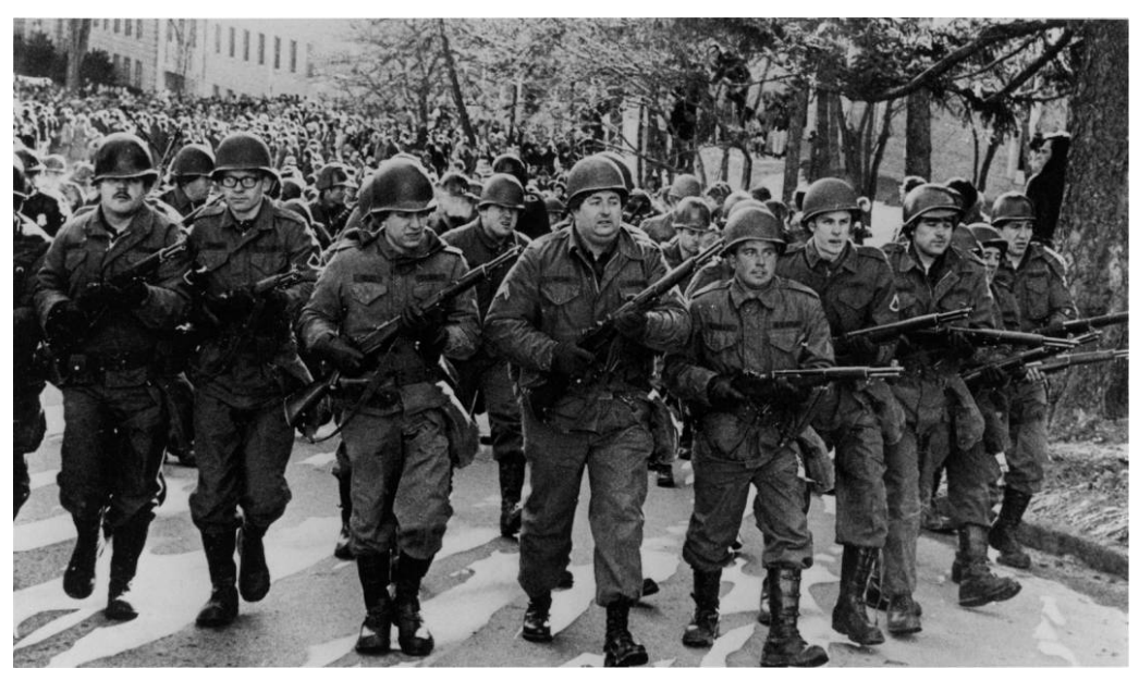
FIGURE 3: National Guard troops on the University of Wisconsin-Madison campus, 1969.

nocent, even sympathetic, citizens in the pursuit of their cause. This is the point at which some rebels turned into petty terrorists. This is also the point at which violence grew from a tool for resistance into a defining element of the counterculture. It took on symbolic value as a total rejection of standard, "civilized" authority. It became a marker of status for a small group of men and women who came to think of themselves as guerrilla fighters, battling to save society from itself.<sup>63</sup>