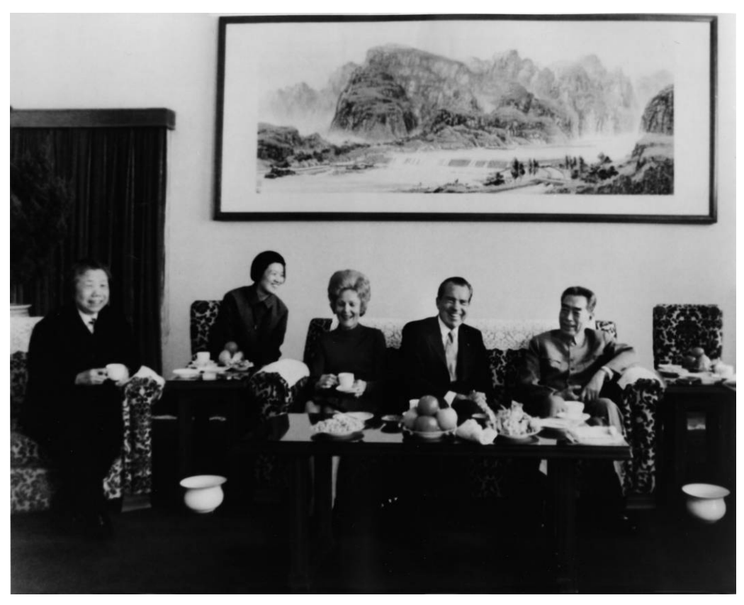
FIGURE 4: Richard and Pat Nixon at tea with Zhou Enlai, February 1972.

weakness with diplomatic acumen. It was a reaction to domestic pressures for peace and fears of continued Cold War militarization. "We were," Kissinger explained, "in a delicate balancing act: to be committed to peace without letting the quest for it become a form of moral disarmament, surrendering all other values; to be prepared to defend freedom while making clear that unconstrained rivalry could risk everything, including freedom, in a nuclear holocaust."